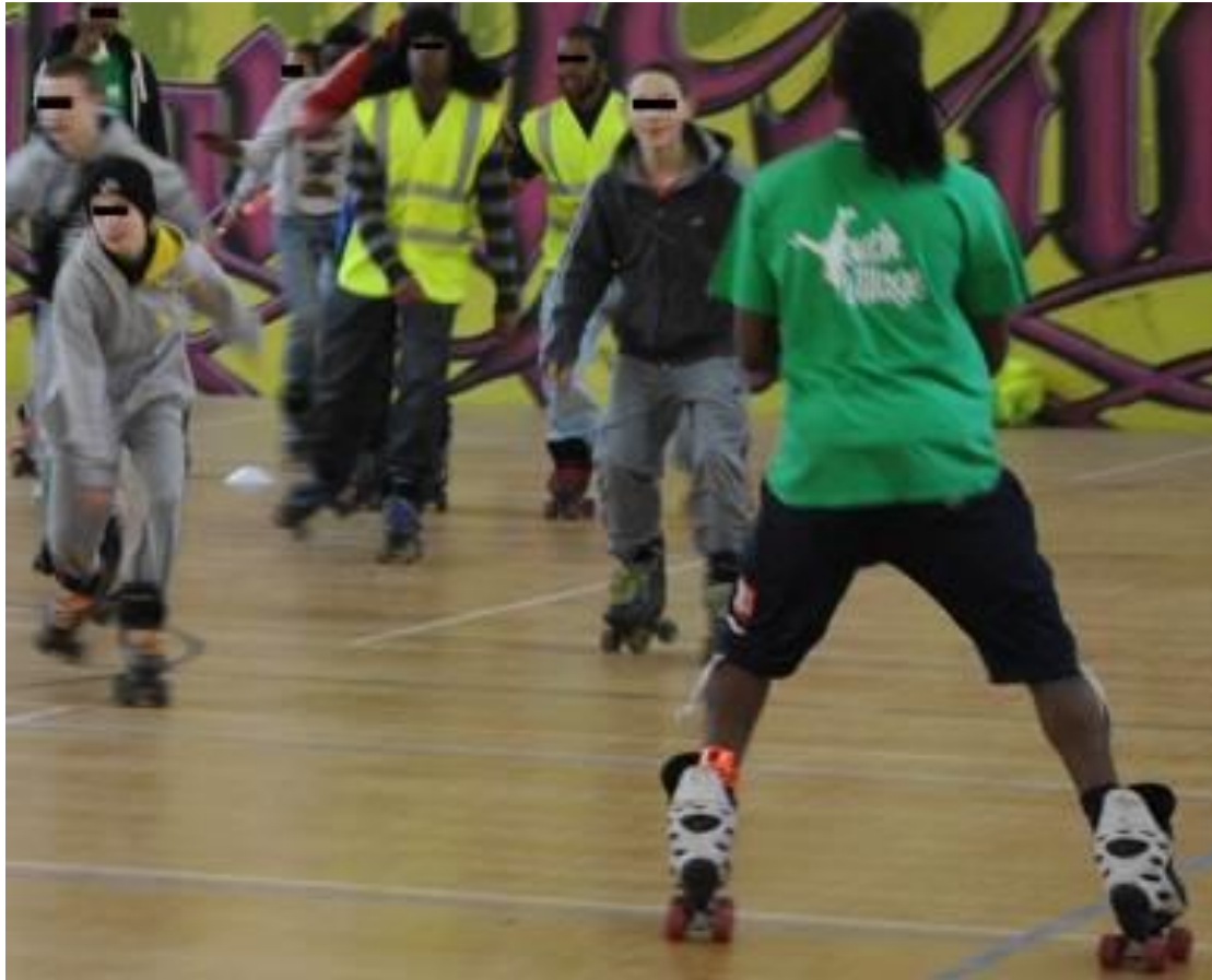
Image 3. Skate Safe Lessons at the workshop.