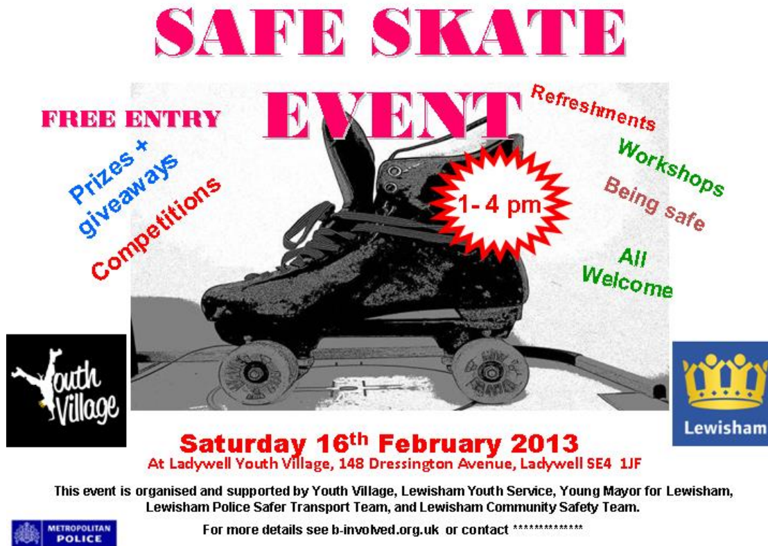
Image 2. Skate Safe Event Poster.