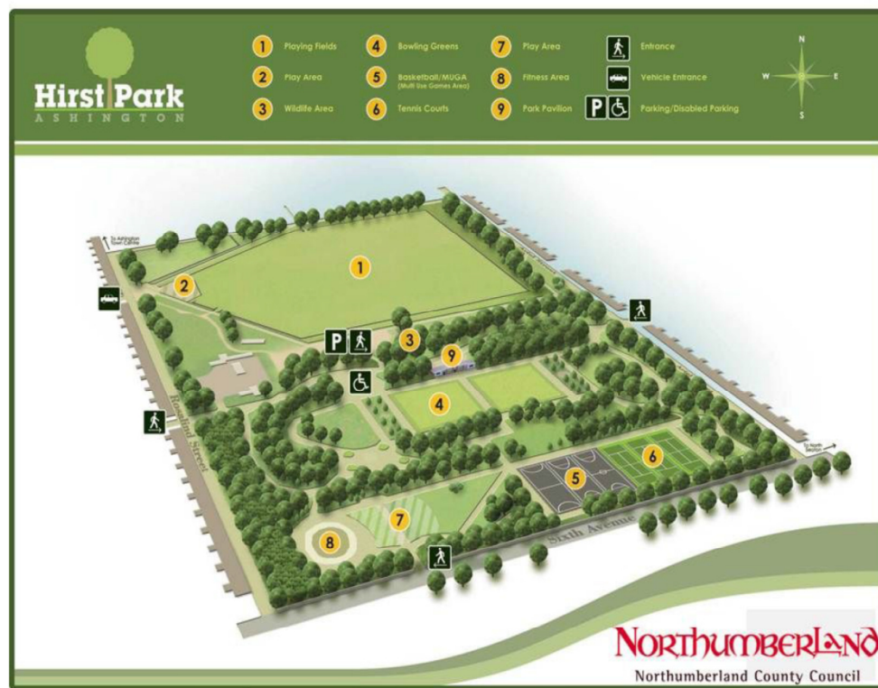
Fig 1: Plan view of Hirst Park