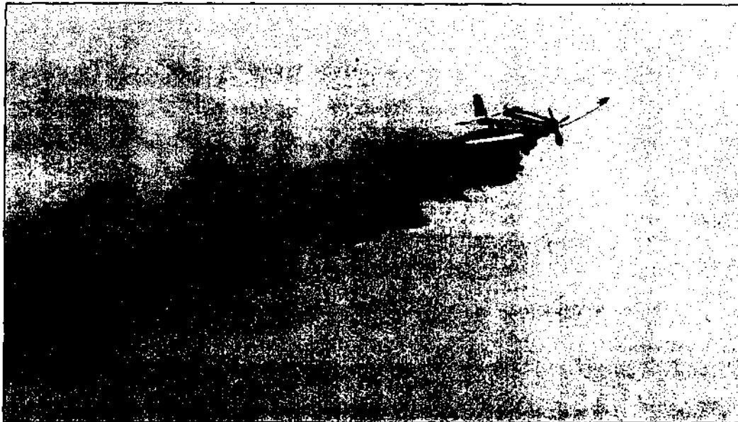
AERIAL ASSAULT: A plane flies through thick haze Saturday as it dumps retardant on a fire near Summer Lake, Ore.