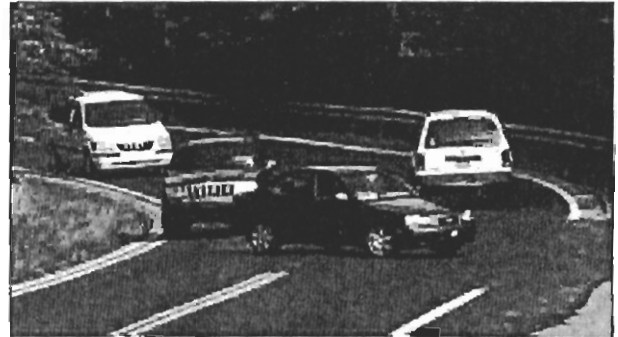
A car turned across Ky. 22 onto Ten Broeck Way, the most dangerous intersection on a portion of the road that was surveyed in a study done for the state. Twenty-six accidents occurred there in a three-year period.