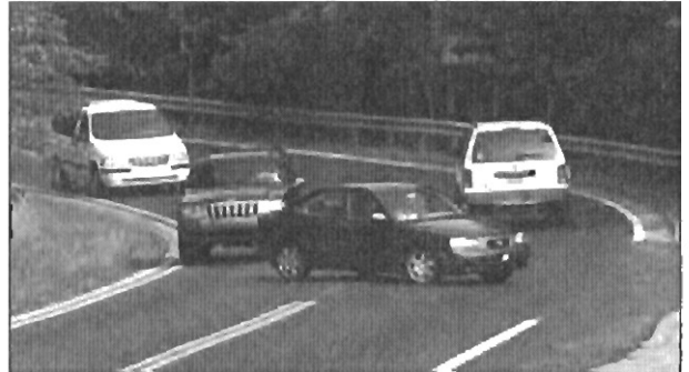
A car turned across Ky. 22 onto Ten Broeck Way, the most dangerous intersection on a portion of the road that was surveyed in a study done for the state. Twenty-six accidents occurred there in a three-year period.