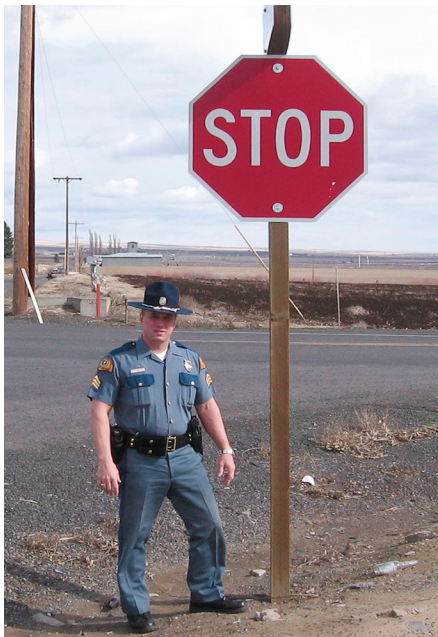
A 36-inch stop sign.

After review and discussion of collision data by stakeholders, the WSDOT lowered the posted speed limit on this section of highway from 55 mph to 50 mph. The new speed limit signs were highlighted with orange flags when initially installed. In addition, the 36-inch STOP signs at the three intersections were replaced with high-profile 48-inch STOP signs.