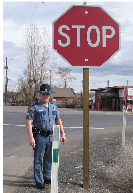
Replacement 48-inch stop sign.

Yakima County Public Services also installed “rumble strips” and appropriate advance warning signs on the approaches to SR 241 at the three intersections involved in the project. (See photos below.)