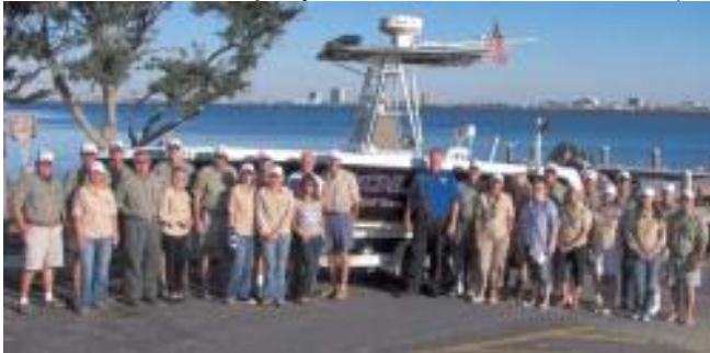
Coastwatchers assembled in front of police boat at Shoreline Park boat launch in Gulf Breeze.

Recent budget cuts had reduced the sworn patrol force of the police department and the police boat was sidelined due to the same budget restrictions. By using volunteers, we were able to employ our marine resources (boat, trailer, dock, communications) and