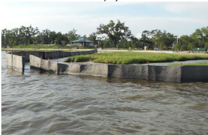
Example of boom deployed to protect environmentally sensitive area of Gulf Breeze shoreline.

To avoid recruiting and coordinating many civilian boats, also the possibility of contaminating them with oil, we decided to use the police boat, boat lift and the communications equipment to patrol for boom security and potential oil sheen or tar balls or oil globs. Our Coastwatchers also responded directly to reports of oiled wildlife and obtained a precise GPS location to improve response from trained recovery workers. We reached out to residents of the community and to our