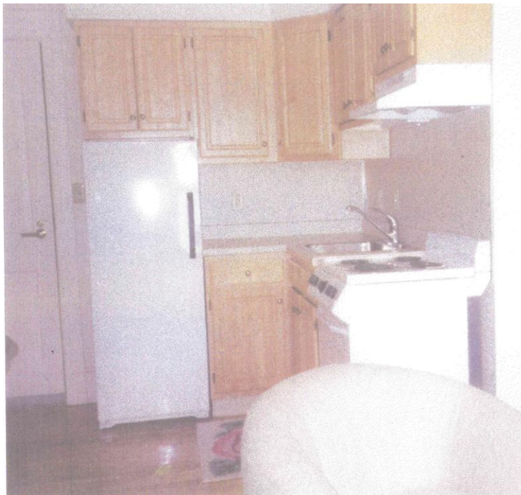
An example of an empty renovated apartment by Domus incorporated