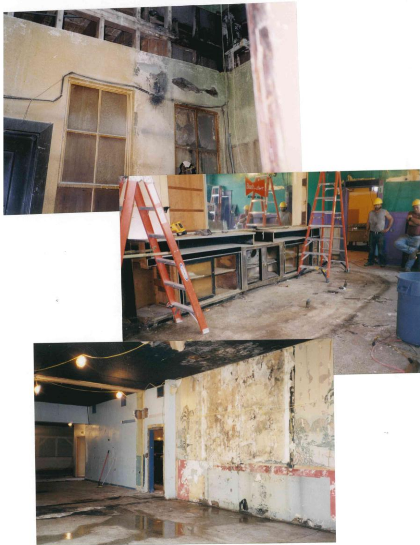
Domus Incorporated renovations to 101 Meadow Street The Meadows Apartments