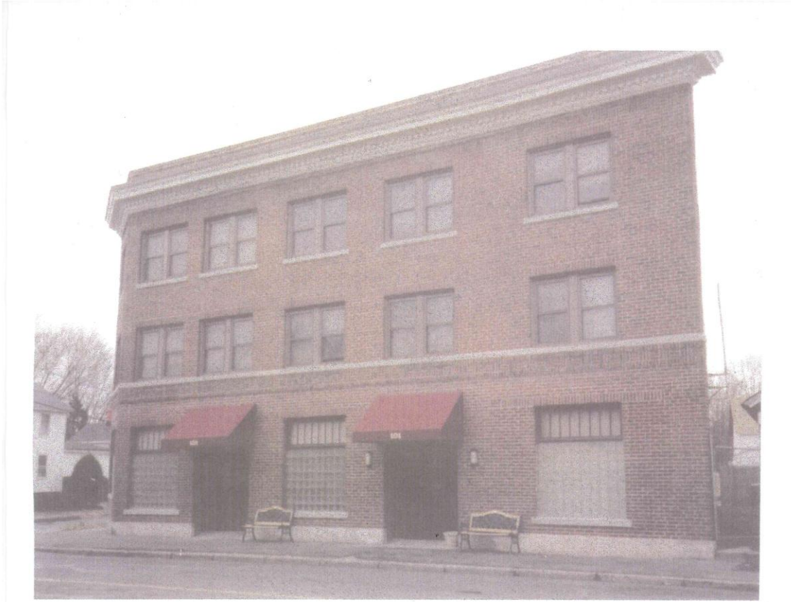
The Meadows Apartments 2011