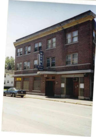
101 Meadow Street prior to Domus Incorporated renovations