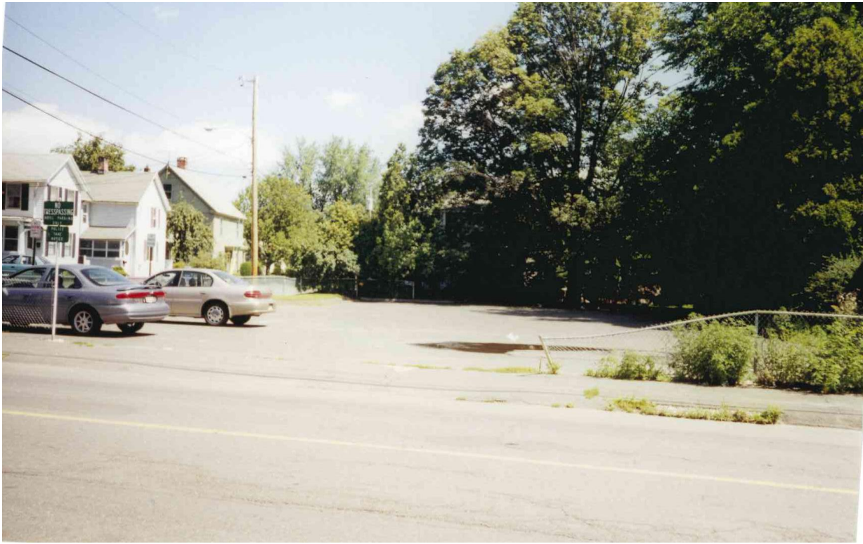
101 Meadow Street parking lot prior to the Domus Incorporated renovation