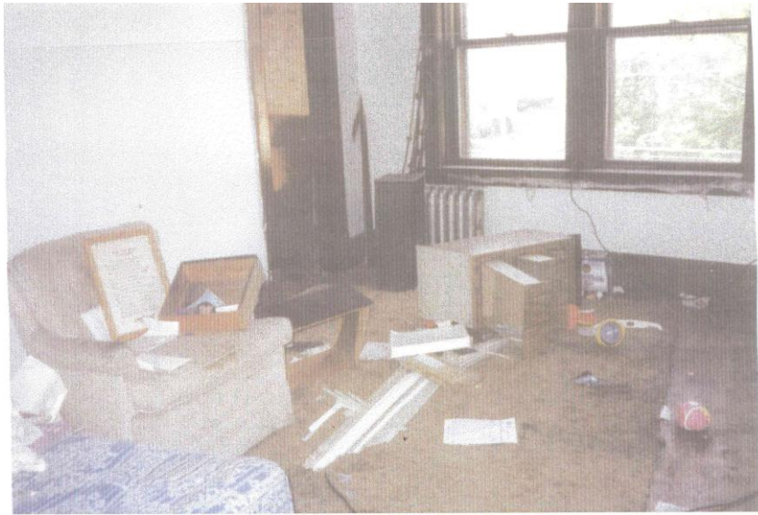
An example of an empty apartment at 101 Meadow St. prior to Domus Incorporated Renovations