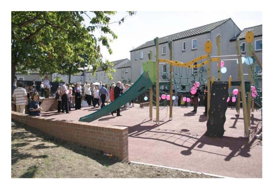
East Craigs play park at it opening in August 2006