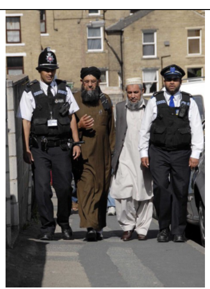
Officers on patrol with Mosque representatives