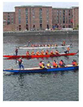
Dragon Boat Finals